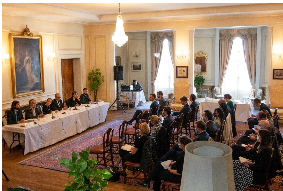
Meeting with Diplomatic Missions, Ankara; Photo by Ronja Koskinen / IPI

Meanwhile, Turkish media regulators including the state broadcast watchdog, the High Council of Radio and Television (RTUK), and the Press Advertising Agency (BIK), continue to issue fines and penalties disproportionately against independent media while fundamental concerns about the accountability and governance of these regulators have still gone unaddressed. The instrumentalization of RTUK and BIK is one of the most visible examples of Turkey's captured media landscape, where the vast majority of mainstream media is under the sway of the government, directly or indirectly, and key state institutions are abused by the ruling parties to harass the remaining independent media.