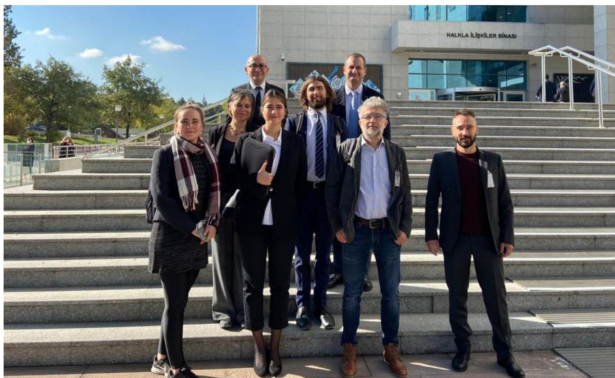
Mission Delegation, Ankara