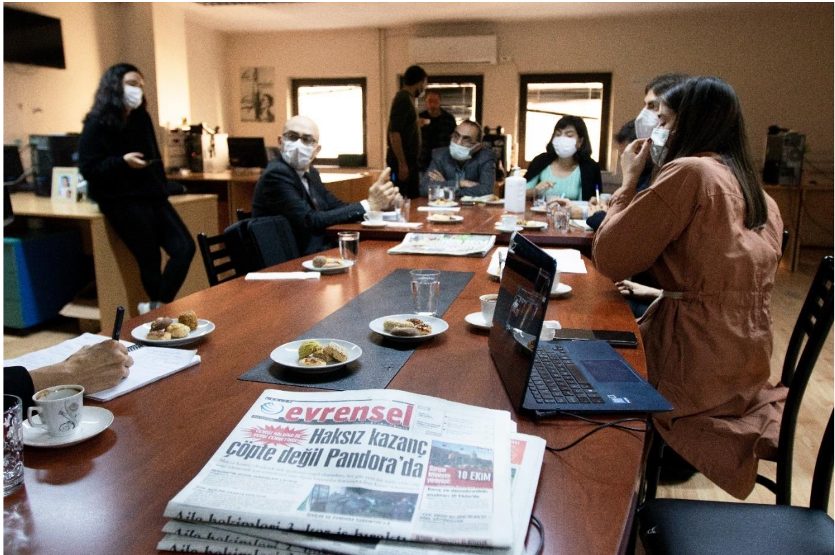
Newsroom visit to Evrensel