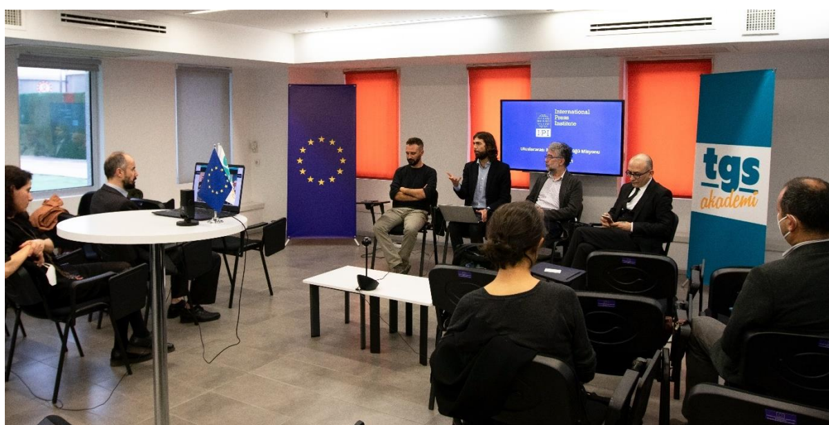
The mission concluded with a press conference hosted by the Turkish Journalists Union where the preliminary conclusions were presented.

Plans for a disinformation law are likely to result in further criminalization of freedom of expression and independent journalism online. Meetings with MPs and journalists confirmed that the law is expected to introduce criminal penalties – and possible jail sentences – for those who spread “disinformation” online. Such a law – an authoritarian move which flies in the face of international standards on freedom of expression – would cement control over one of the last spaces for free expression remaining in Turkey and increase pressure on social media companies to become complicit in Turkey's censorship regime.