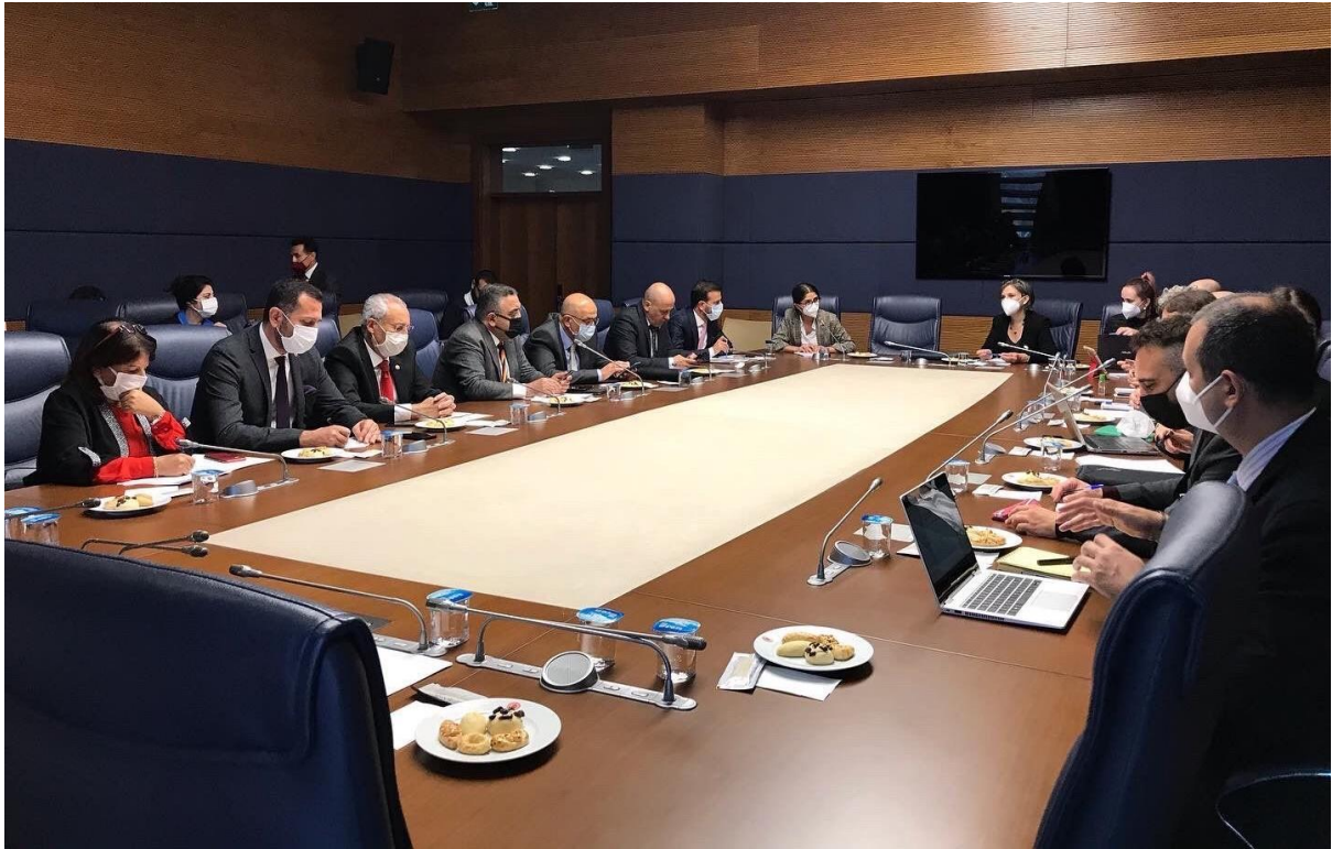
Meeting with Members of Parliamentary Committee on Human Rights

The opposition MPs who met with the mission agreed that while the courts are frequently used to persecute journalists, they turn a blind eye to violence against media professionals. The parliamentarians further accused President Erdoğan, MHP leader Devlet Bahçeli, Interior Minister Süleyman Soylu and other government officials of encouraging a climate of violence through their verbal attacks on critical journalists. 13