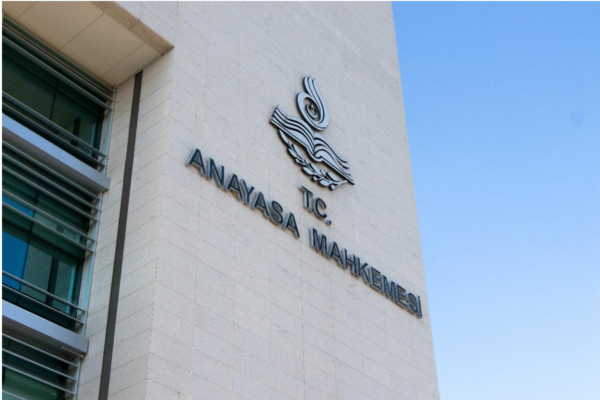
Constitutional Court Building, Ankara

For its part, the Constitutional Court is often seen as the last judicial institution not yet captured by the state and therefore a crucial line of defence in the protection of fundamental human rights while operating under intense political pressure.